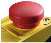
NH E-Stop Operator for position 1