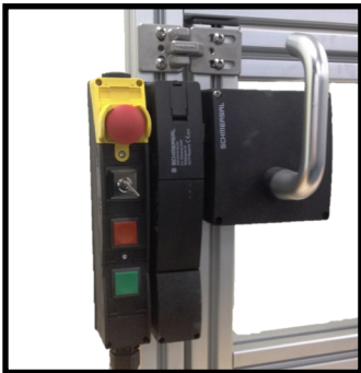
BDF200 fits standard housing extrusions and aesthetically matches our AZM200.