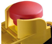
NHK Collared E-Stop Operator for position 1