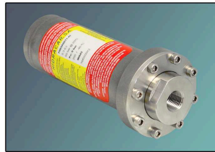
F002 to F007