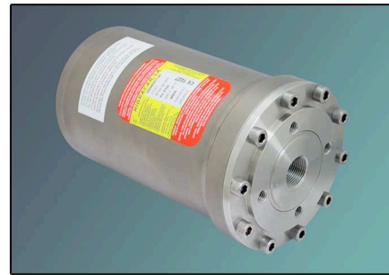
F015 to F100